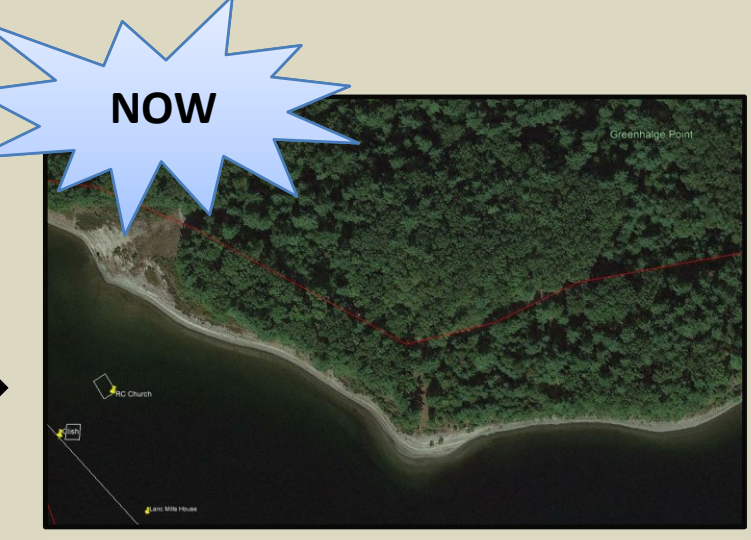
The Location Today In the Wachusett Reservoir, just off Greenhaige Point in Boylston, Massachusetts